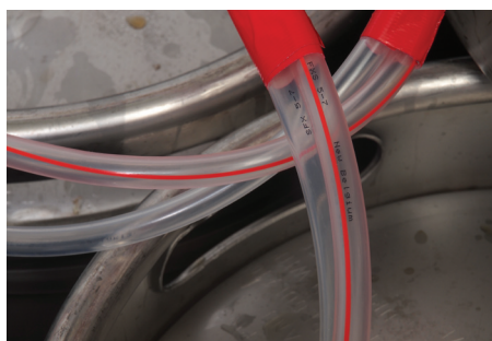
Clear Gas Line Tubing with Red Stripe for Identification