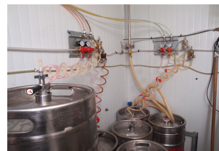
Kegs Tapped and Flowing with Brew Ultra Barrier™ and Brew Silver™

EJ Beverage - An Eldon James Company • 10325 E. 47th Ave. • Denver, CO 80238