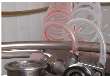
Red Stripe Gas Line (left) Antimicrobial beer Line (right)