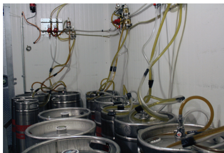
Old PVC Tubing Replaced