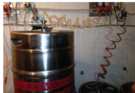
Coiled Tubing Provides Cleaner Look