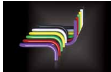
Custom Formed Tubing