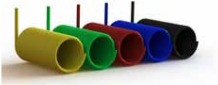
Custom Coiled Tubing